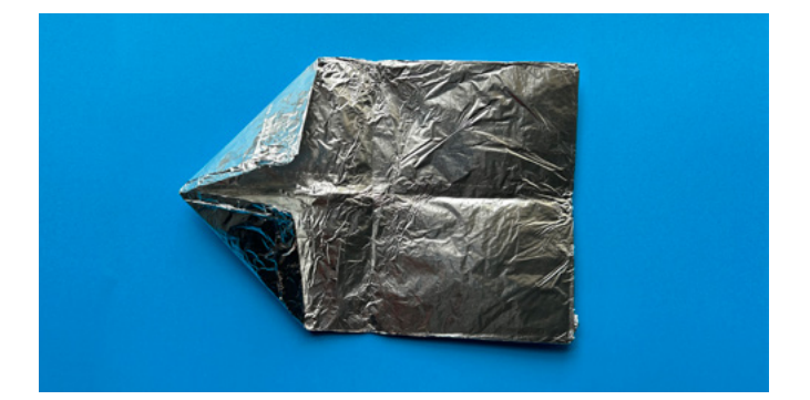
STEP 5: Flip plane over and fold in half

STEP 3: Create two arrow folds. Then fold both edges to the middle so they are aligned